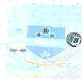
Vice-Chancellor MAKAUT, WB