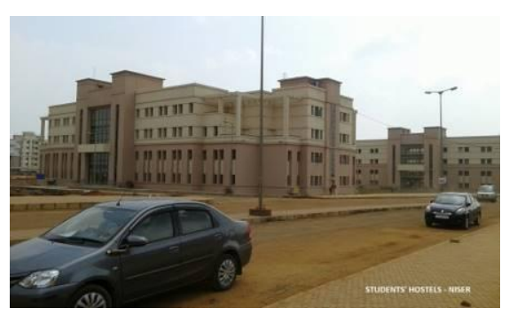
Students' Hostel, NISER, Bhubaneswar