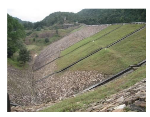
Saraphgarh Earth Dam