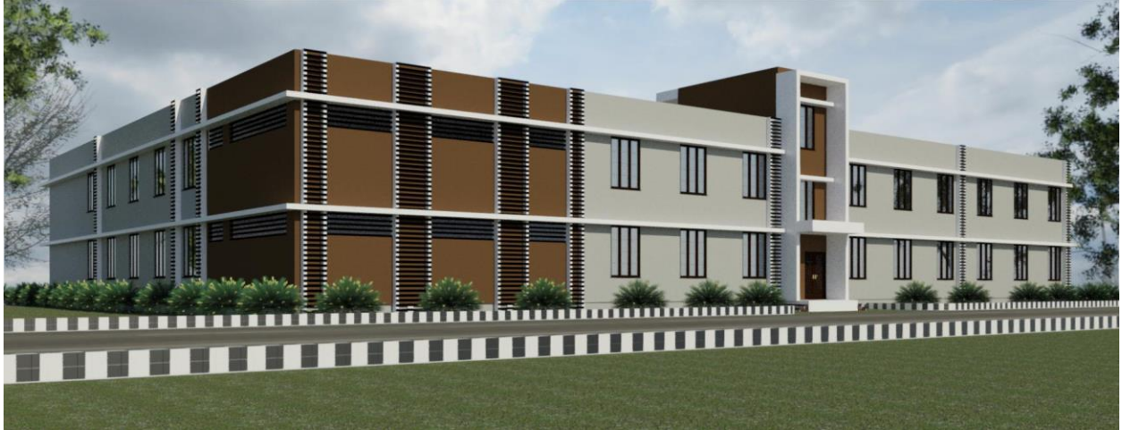
SHAHI DORMITORY, PHASE 2 SHIVAMOGGA.