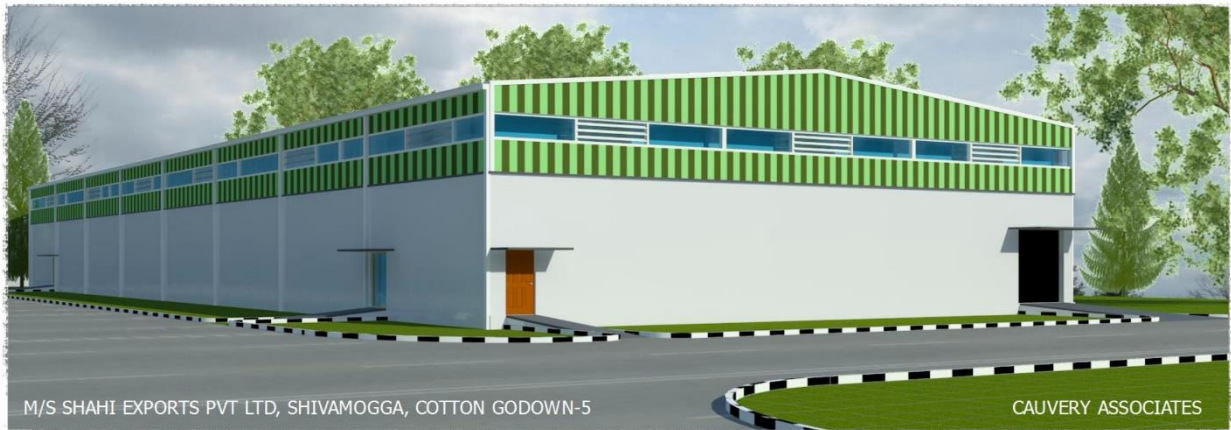
SHAHI EXPORTS PVT LTD SHIVAMOGGA, COTTON GODOWN-5.