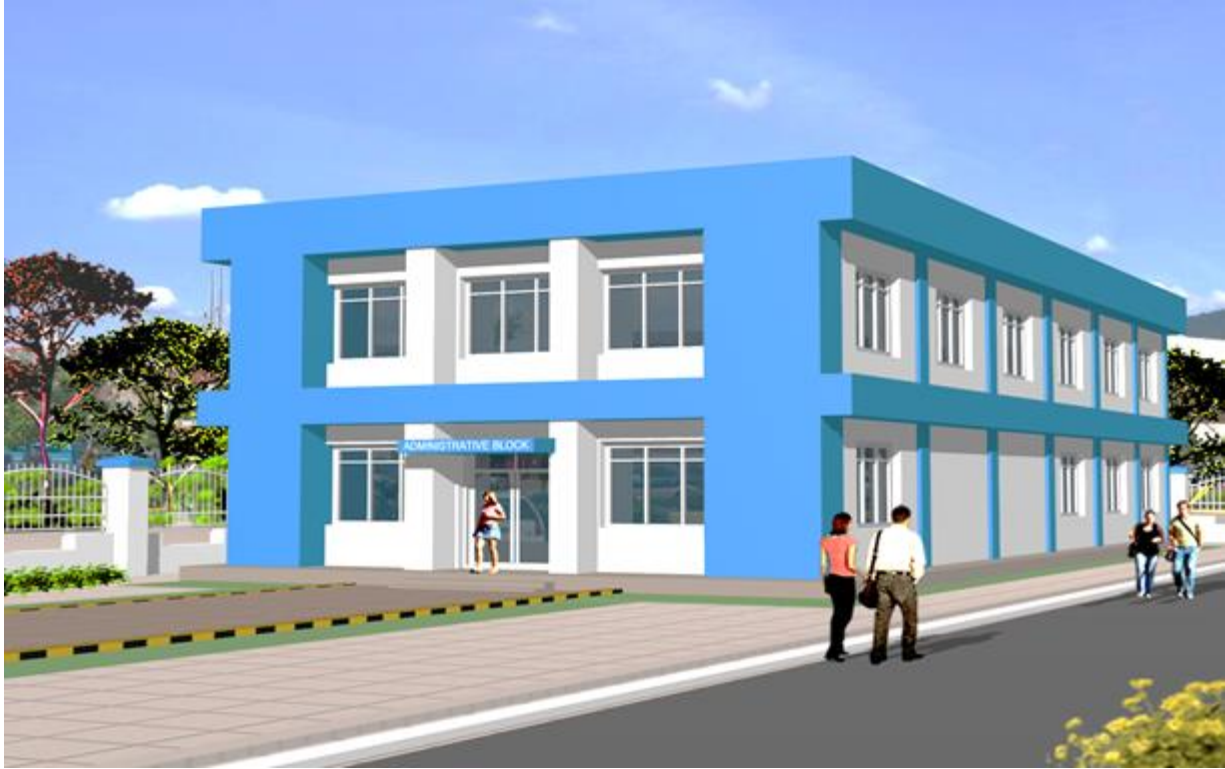
TTK PRESTIGE LTD, OFFICE BLOCK, ROORKEE, UTTARAKHAND