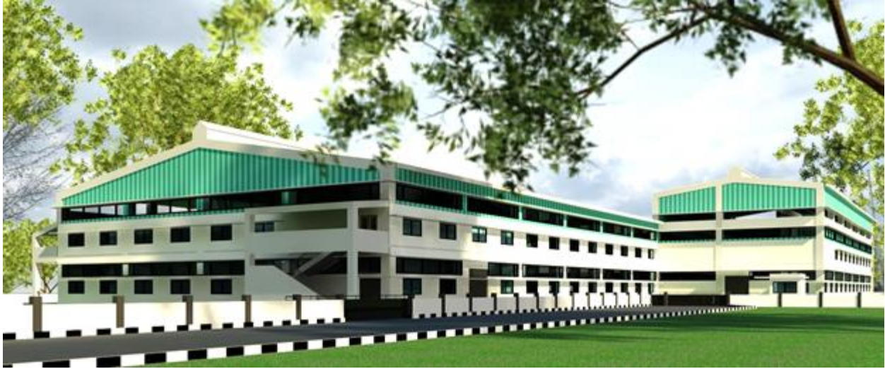
SHAHI EXPORTS PVT LTD, SAGARA