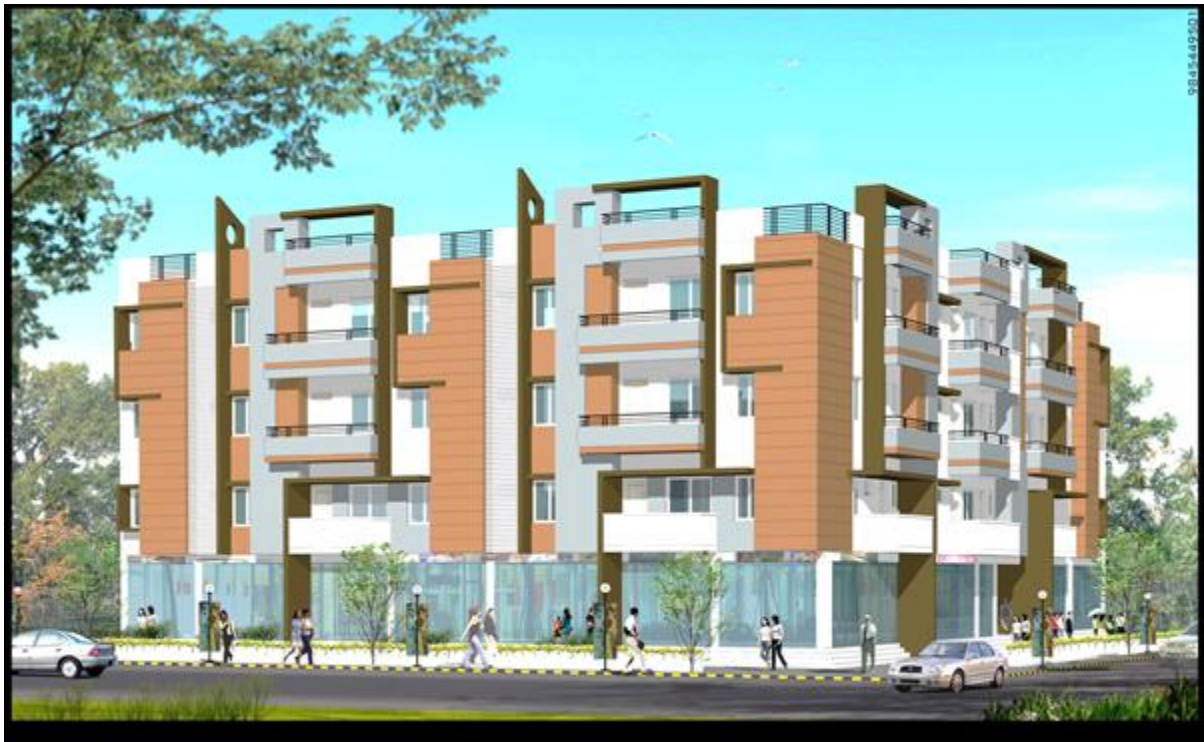
VISHWAS DAFFODIL, RAMACHANDRAPURA, BENGALURU.