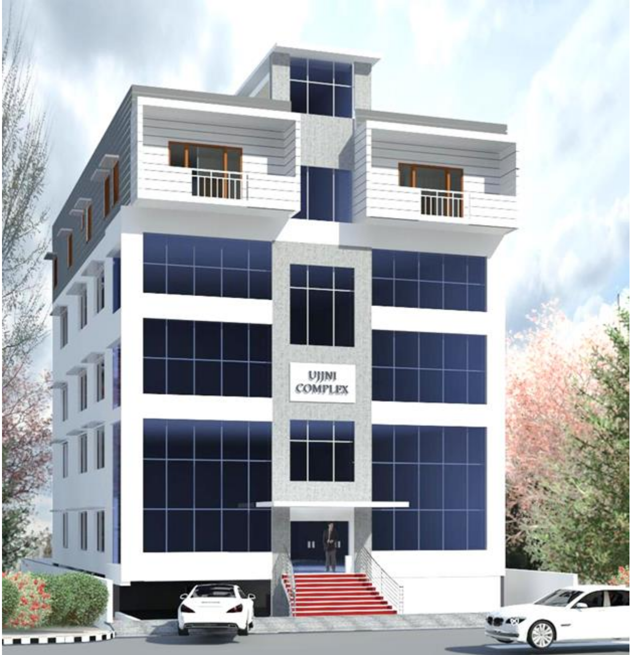
UJUNI COMPLEX AT CHANDRA LAYOUT.