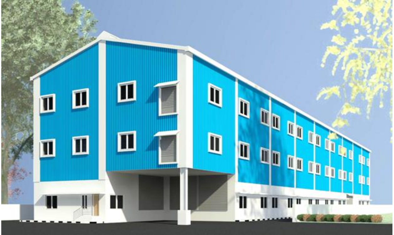
TTK PRESTIGE LTD, WARE HOUSE, HOSUR.