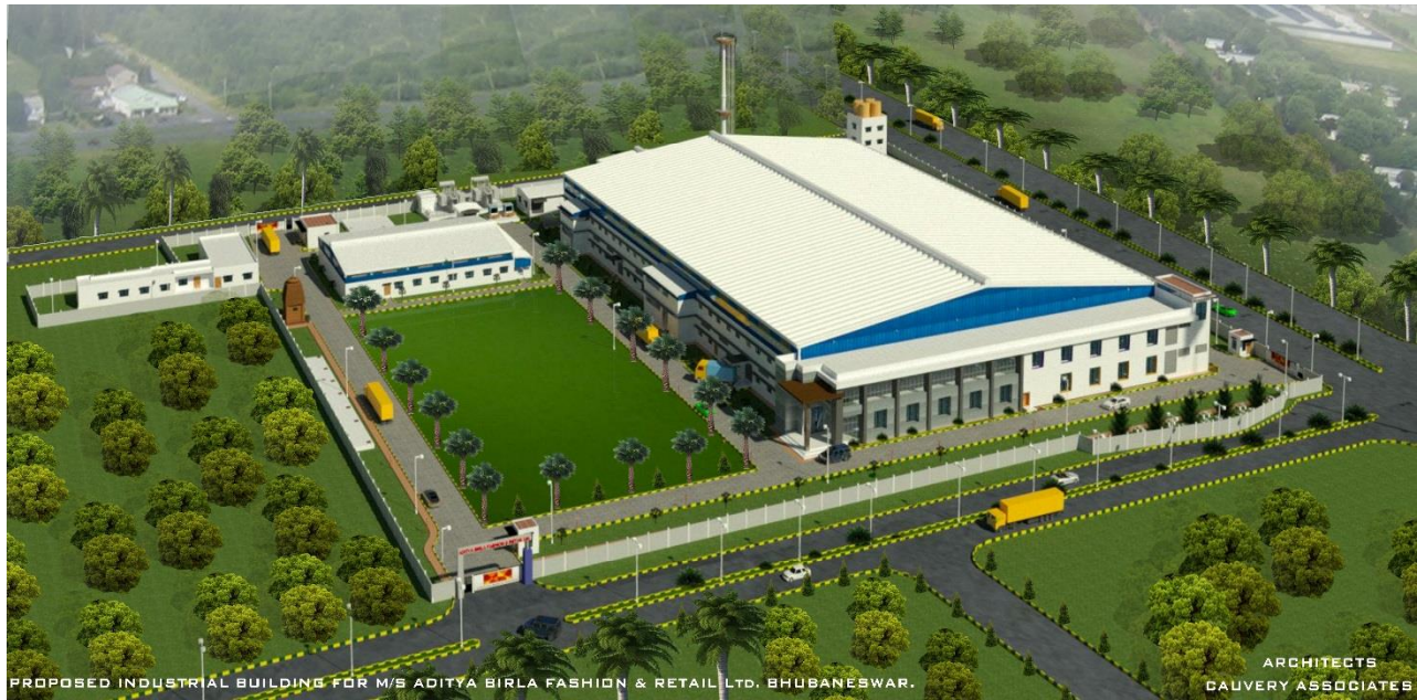
M/S ADITYA BIRLA FASHION & RETAIL LTD. AT BHUBANESHWARADI