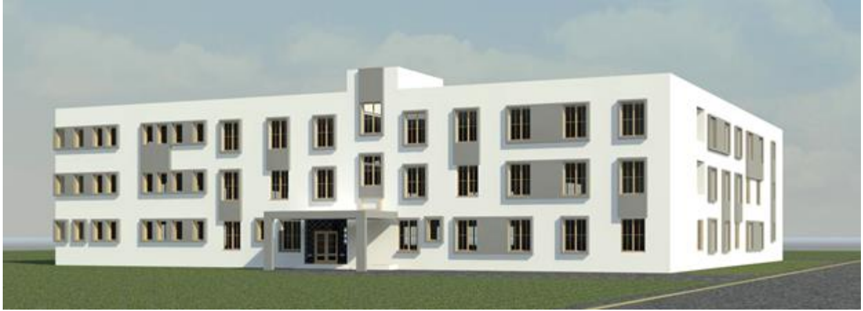
SHAHI DORMITORY, PHASE 1 SHIVAMOGGA.