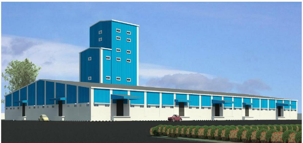
GODREJ AGROVET, KUNIGAL ROAD, TUMAKURU.