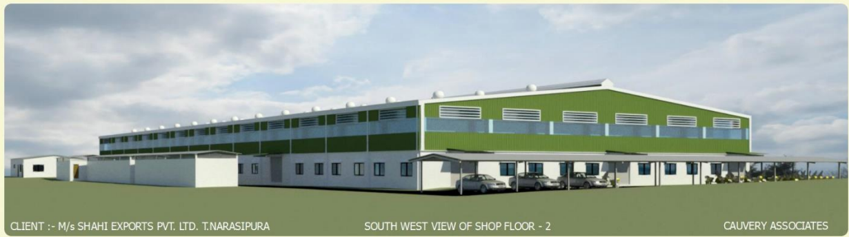
SHAHI EXPORTS PVT LTD T. NARASIPURA PHASE-2.