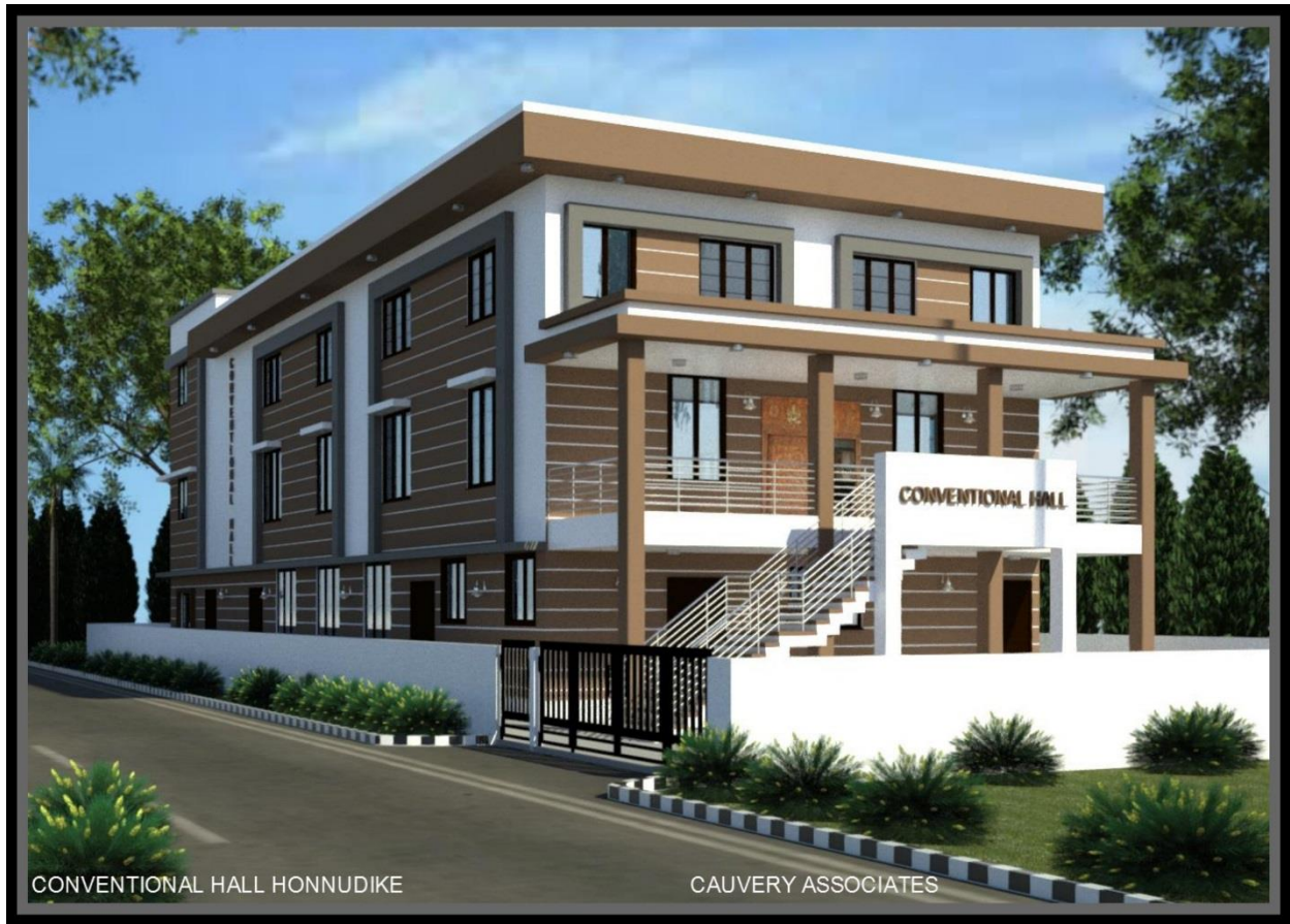
SAMUDAYA BHAVANA AT HONNUDUKE, TUMAKURU.