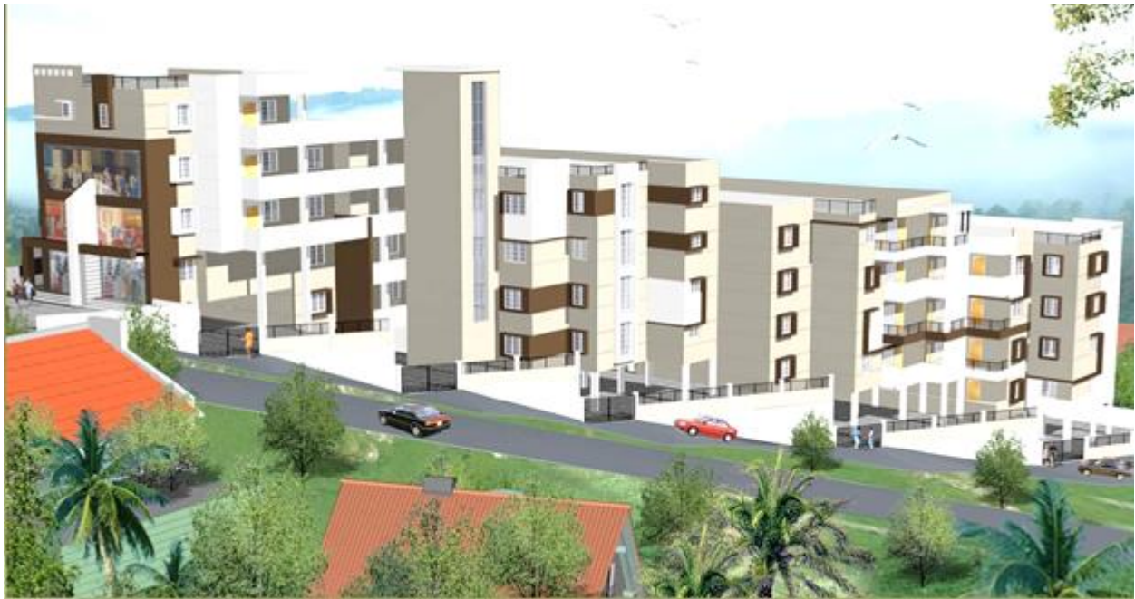
SKYLINE APARTMENT, MANGALORE.