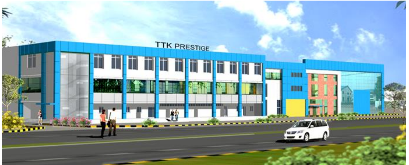
TTK PRESTIGE LTD, COIMBATORE.