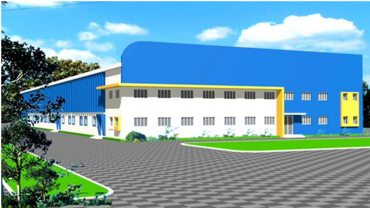
BIGBAGS LTD, DABASPET.