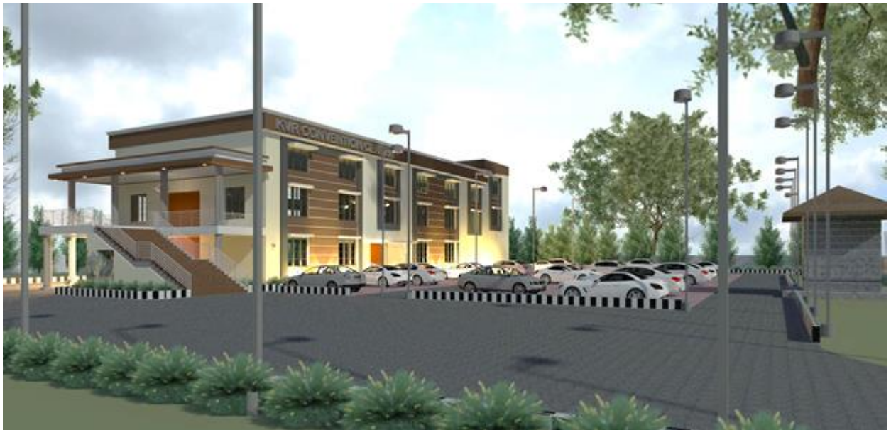
KVR CONVENTION CENTER AT KOLAR.