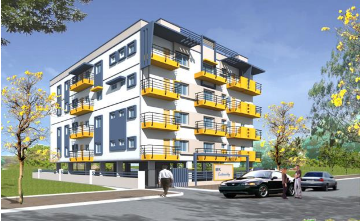
B K ETERNITY, BENGALURU.