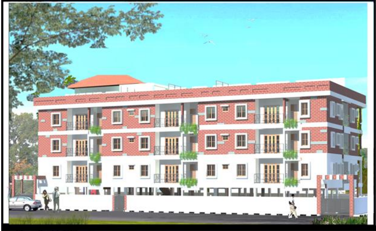
FLOATING GARDENS, WHITEFIELD.