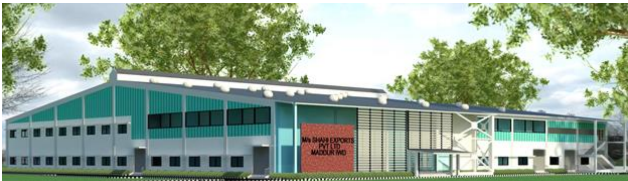
SHAHI EXPORTS PVT LTD, IWD, MADDUR PHASE-4.