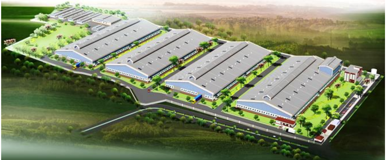
BIG BAGS LTD, UNIT-1 AND UNIT 2, UNIT 3 GANGIMAT, MANGALORE