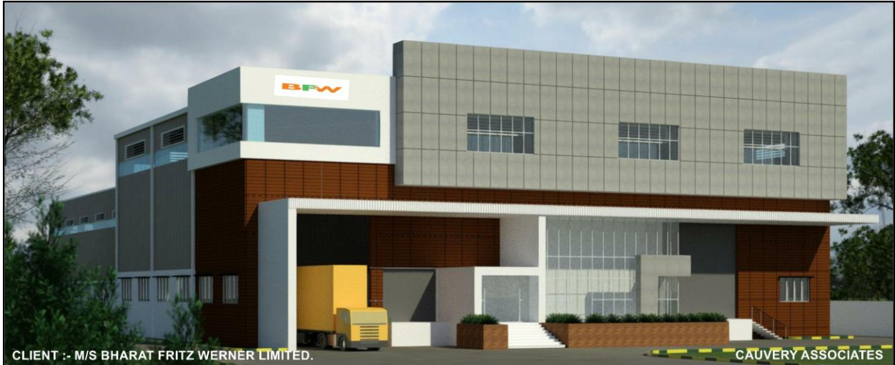
BFW LIMITED, CNC DIVISION, HOSUR.