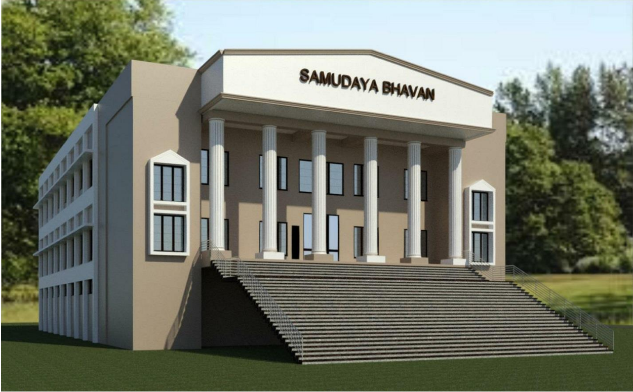
AMARA SHILPI JAKANACHARYA SAMUDAYA BHAVAN AT TUMAKURU.