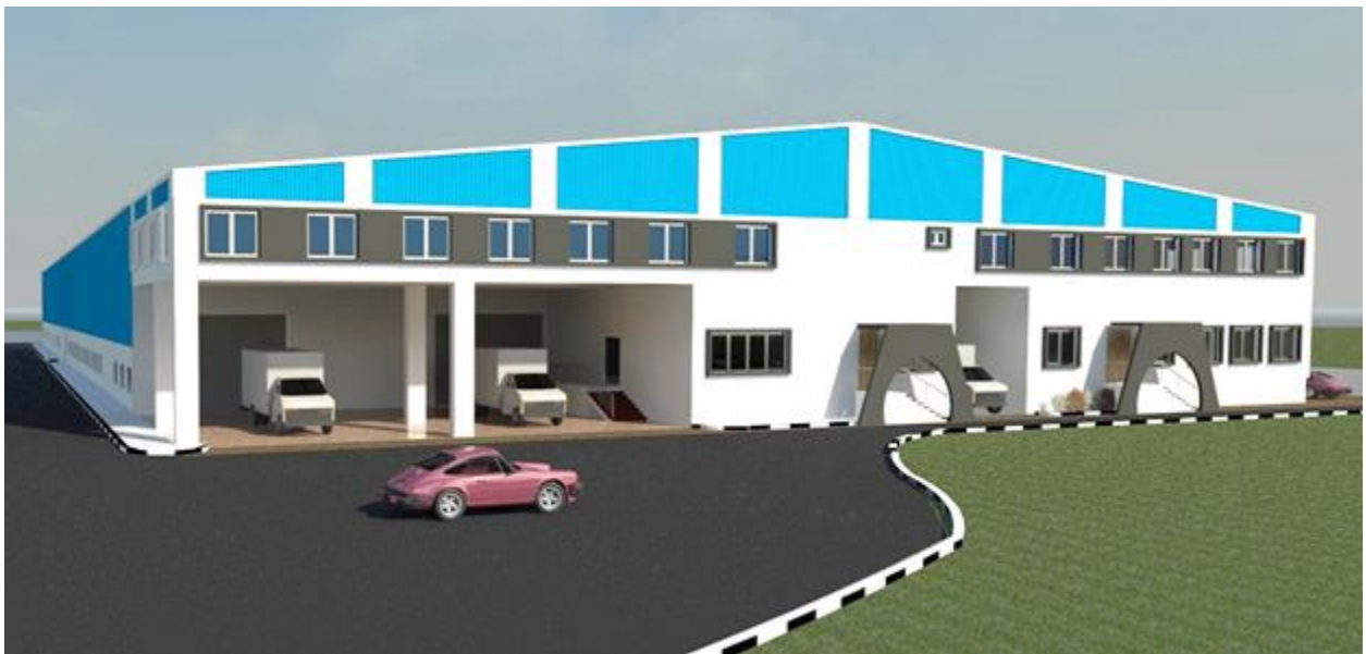
GCL INDIA, DABASPET.