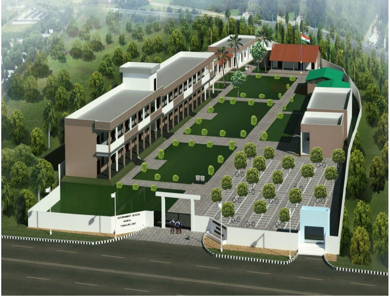
GOVERNMENT SCHOOL AT MASKAL, TUMAKURU.