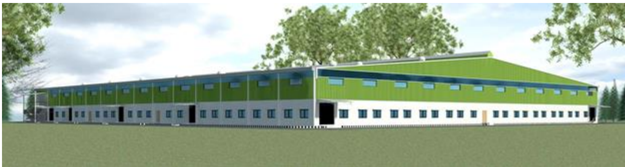
SHAHI EXPORTS PVT LTD T. NARASIPURA PHASE-1.