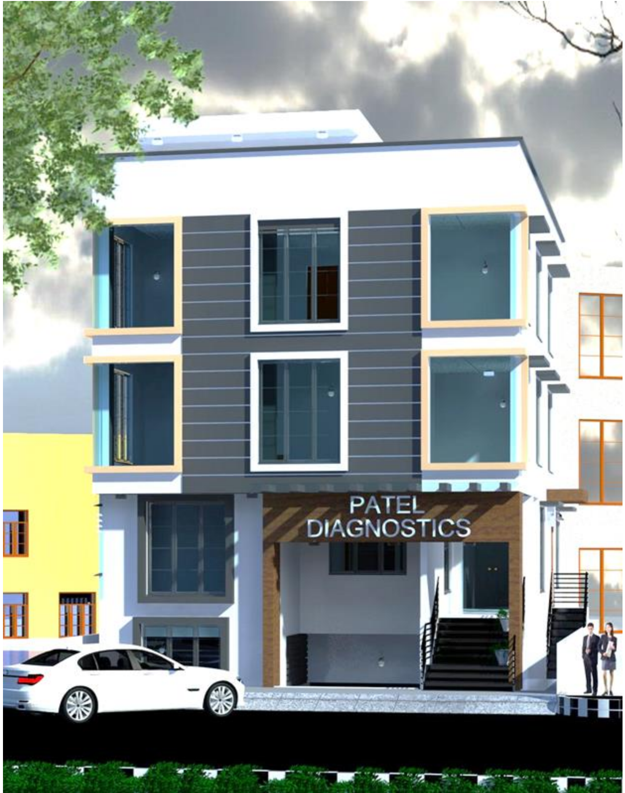
PATEL DIAGNOSTICS AT YELAHANKA.