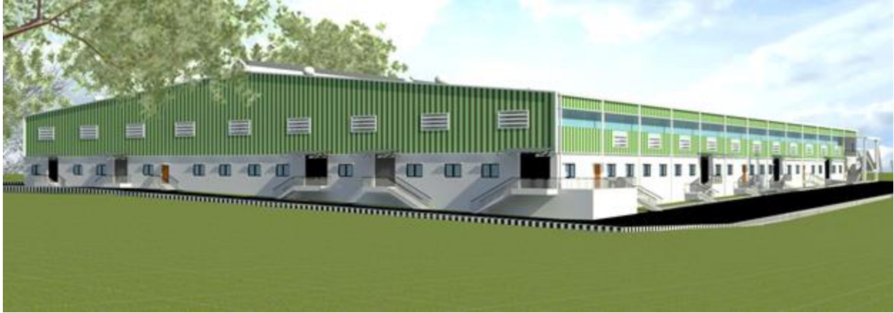
SHAHI EXPORTS PVT LTD, KUPPAM.