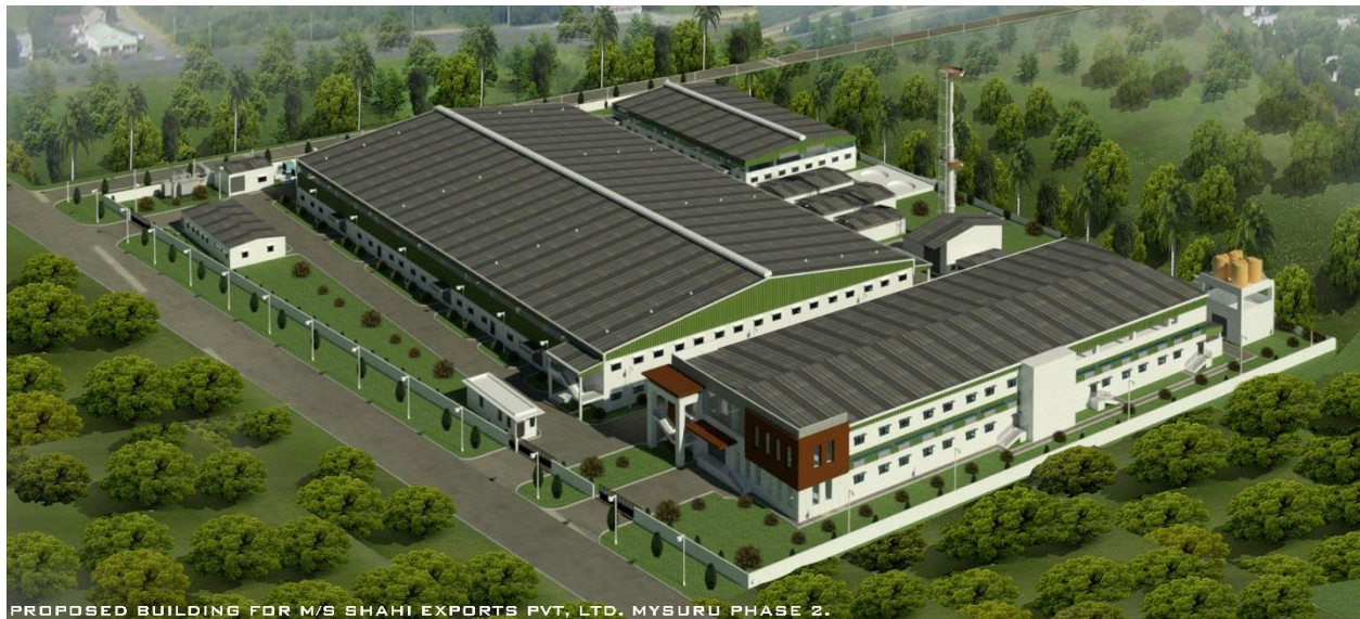
M/s SHAHI EXPORT PVT, LTD MYSURU -2