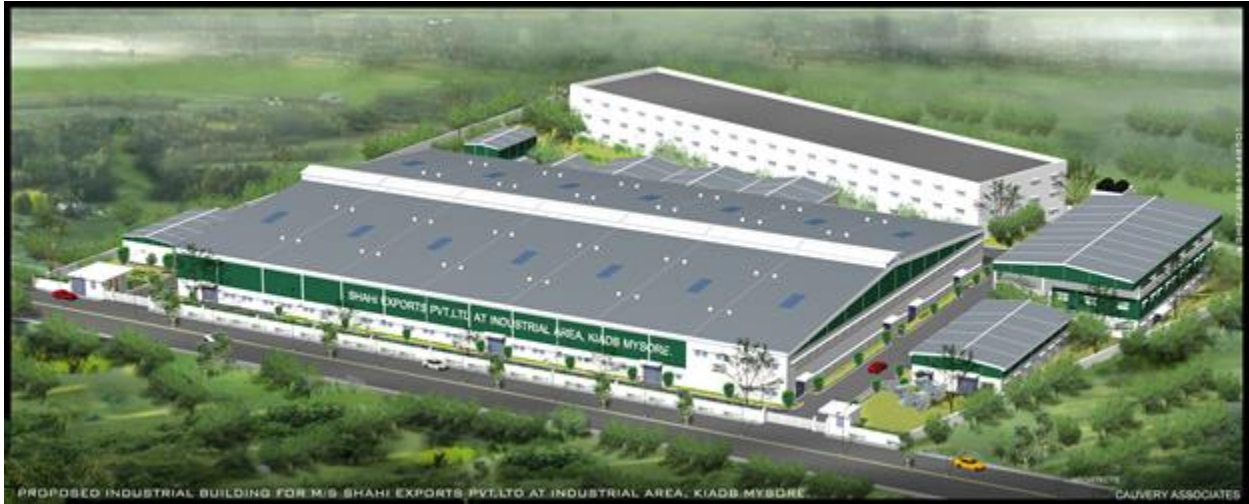
M/s SHAHI EXPORT PVT, LTD MYSURU – 1