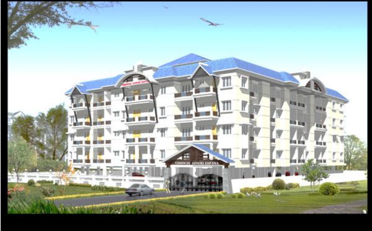
GOWRI ESPANA ,VIDYARANYAPURA ,BENGALURU