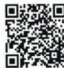
DATE OF ISSUE