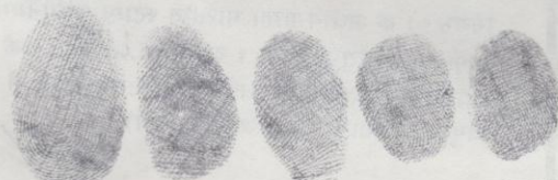
Thumb Index Middle Ring Little