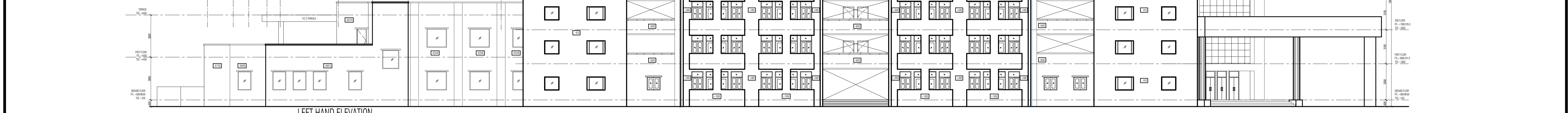
LEFT HAND ELEVATION

NIT JAMSHEDPUR GENERAL NOTES: 1. ALL DIMENSION IN MM (MILLIMETRES) UNO. 2. DO NOT SCALE THE DRAWING. 3. REFER TO OTHER DRAWINGS WHERE CROSS REFERENCES ARE INDICATED. 4. ALL DRAWINGS SHALL BE READ IN CONJUNCTION WITH ALL RELEVANT STRUCTURAL, E&M SERVICES & SYSTEM DRAWINGS. 5. FOR CLARIFICATIONS / DISCREPANCIES RAISE A TECHNICAL QUERY TO ARCHITECT. 6. REFER PROJECT DRAWING REGISTER TO ENSURE THAT YOU HAVE LATEST REVISION. REVISION DATE DESCRIPTION THIS DRAWING IS A "COPYRIGHT" CONTENT OF EPC ARCHITECT. THIS DRAWING OR PART THERE OF MAY NOT BE USED OR REPRODUCED WITHOUT THE PERMISSION OF