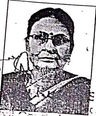
Singh Cate Court, Jamshedpur