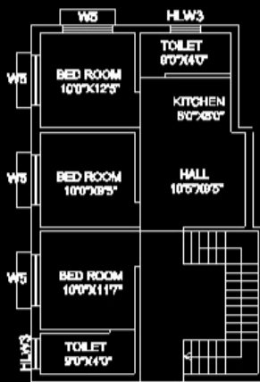
GROUND FLOOR PLAN BUILT UP AREA= 559.56 SQ.FT