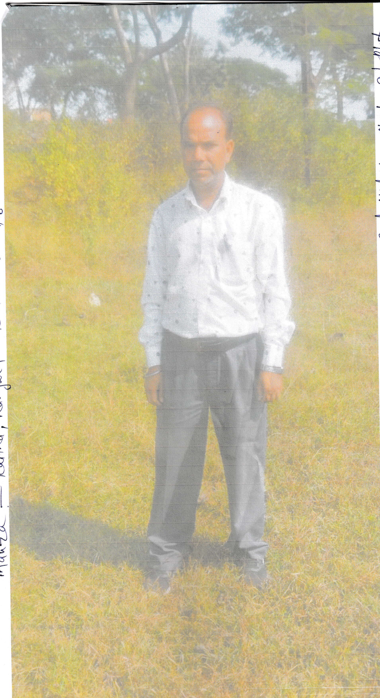
Road Widening photo of Plot

Building Plan Case No :- RNP/SP/0031/W26/2022 Applicant :- Sumit Pr. Ambasta Plot No :- 1907 Manza :- Kaitha, Rangarh Khata no :- 78