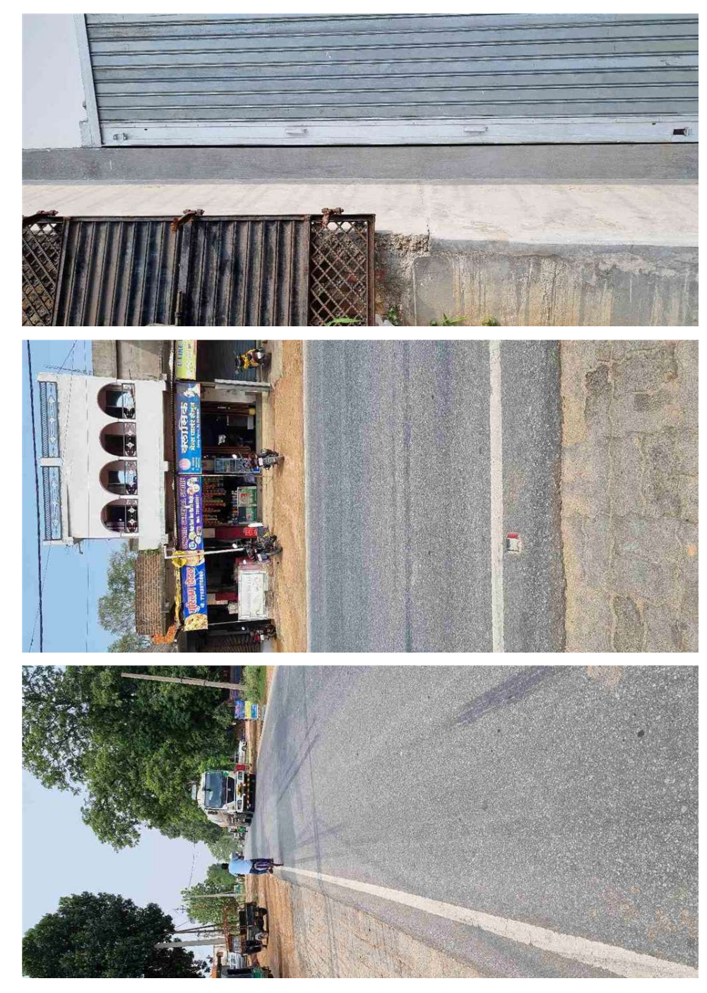
Recommendation : Verified & found Ok Remark : All documents are verified and found correct