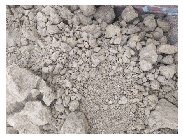
Recommendation: Verified & found Ok