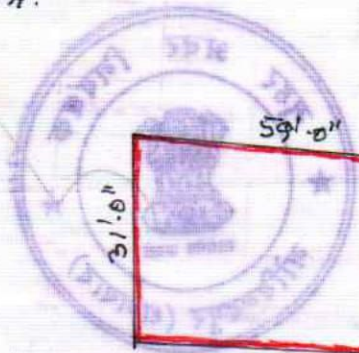
SITE PLAN. NOT TO SCALE.