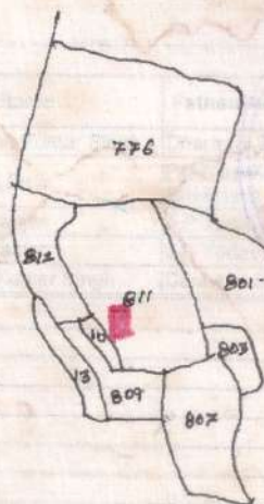
KEY PLAN. SCALE. 1" = 330'0"

BOUNDARY :- NORTH :- 16'-0" WIDE RASTA. SOUTH :- PART OF PLOT NO. 811. EAST :- PART OF PLOT NO. 811. WEST :- PART OF PLOT NO. 811.