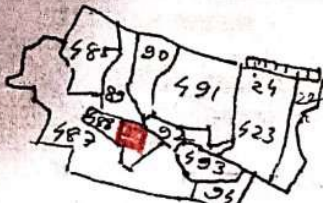
NEW MAP KEY PLAN:- SCALE - 1" = 330'0"

NORTH ... NEW PLOT No. 489, 490, (492) SOUTH ... 20'0" ROAD. EAST ... PART OF THIS PLOT, 16'0" ROAD. WEST ... PART OF THIS PLOT, 20'0" ROAD.