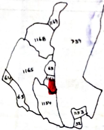
KEY PLAN SCALE . 1/4" = 1 MILE.