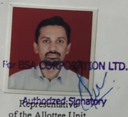
Authorized Signatory Representative of the Allottee Unit