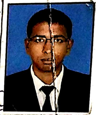
Affix photograph of Representative of the allottee unit