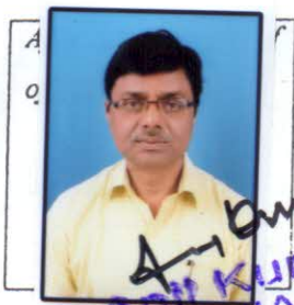
C.I., JIADA Adityapur Region