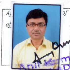
C.I., JIADA Adityapur Region