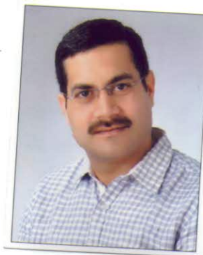
Representative of the Allottee Unit