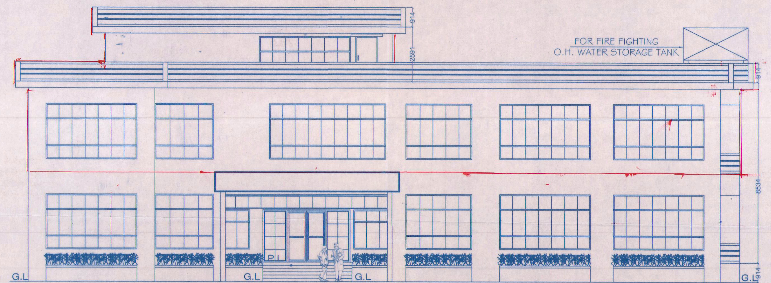
FRONT ELEVATION SCALE-1:100