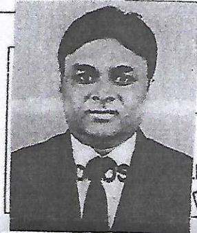
Representative of the Allottee Unit

GOBOSH HOLDINGS LIMITED [Signature] DIRECTOR