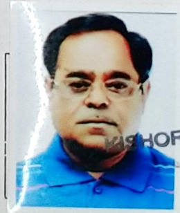
Representative of the Allottee Unit