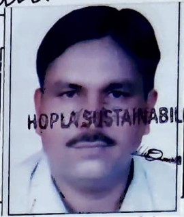
Representative of the Allottee Unit

HOPLA SUSTAINABILITY SOLUTIONS PVT. LTD. Director