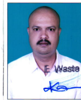
Representative of the Allottee Unit