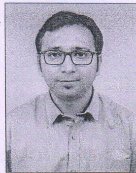
Representative of the Allottee Unit