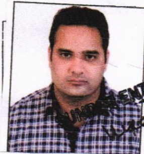
Representative of the Allottee Unit