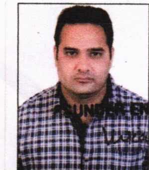
Representative of the Allottee Unit