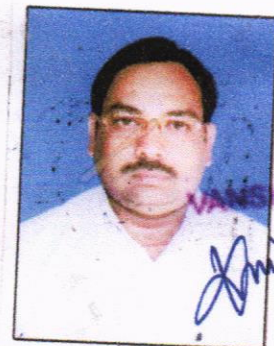
Representative of the Allottee Unit