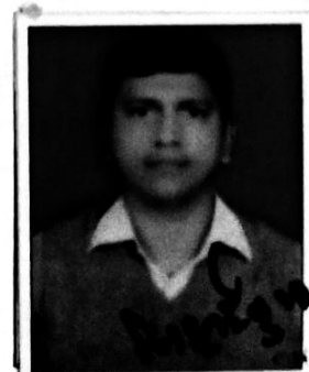
Representative of M/s. Software Technology Parks of India, Ranchi Center Allottee Unit

Handwritten signature and stamp of the representative.