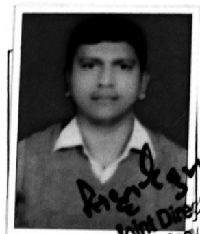
Representative of M/s. Software Technology Parks of India, Ranchi Center Allottee Unit

Handwritten signature and stamp of the representative.