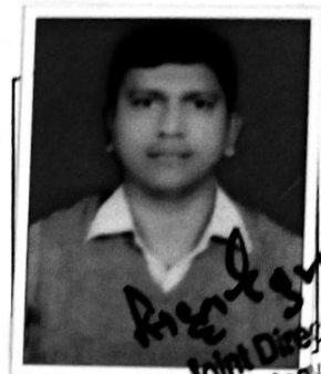
Representative of M/s. Software Technology Parks of India, Ranchi Center Allottee Unit

Signature Joint Director Software Technology Parks of India Ranchi Center