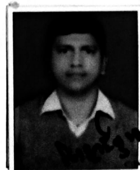
Representative of M/s. Software Technology Parks of India, Ranchi Center Allottee Unit

Signature Joint Director Software Technology Parks of India Ranchi Center