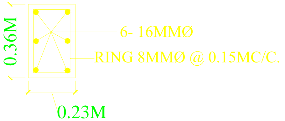
SECTION OF COLUMN.